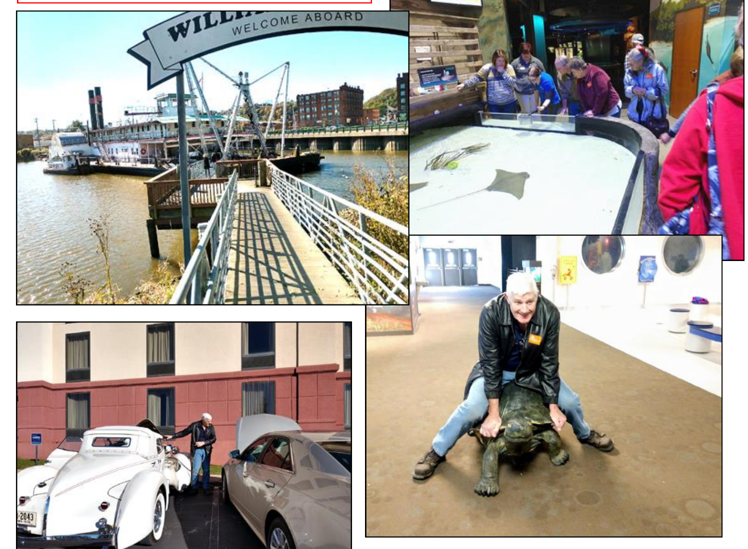
Don't even ask!