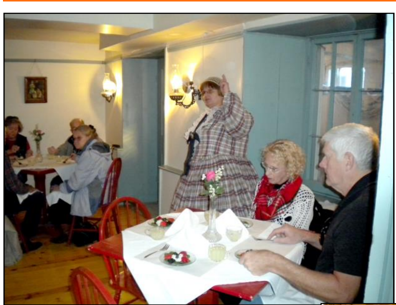
Mathias Ham House