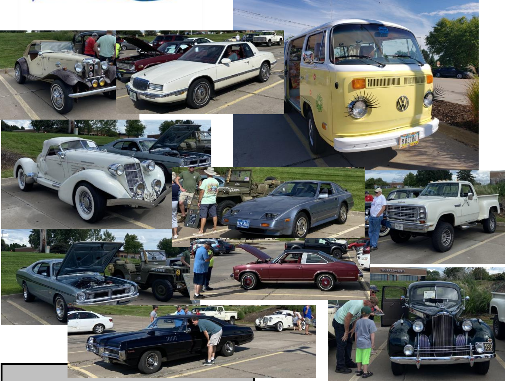
Eric L. Smith Antique Autos

was challenged by overcast skies and rain until just a few minutes before showtime. That did not deter 15 dedicated car enthusiasts from showing up. (Or perhaps they were ice cream enthusiasts.) The group stayed for two hours enjoying conversation with friends.