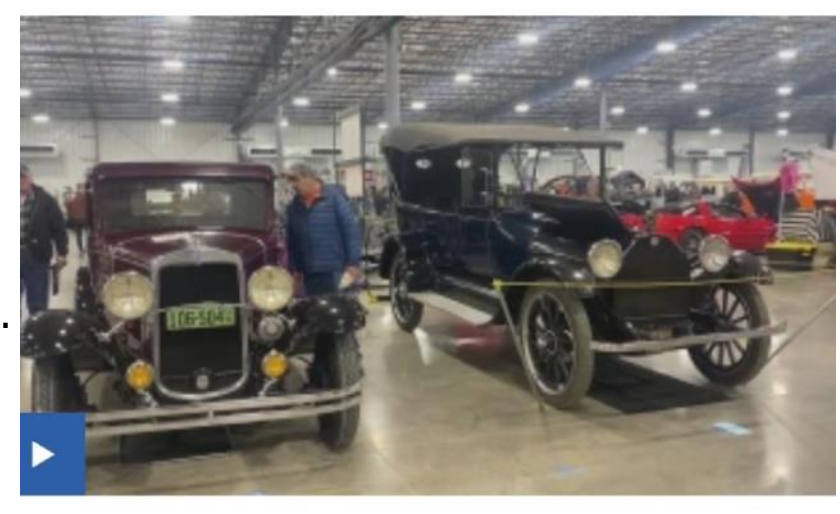
Check out the Quad Cities Rod & Custom Show before it hits the road

Our presence didn't end there, we had 26 members attend the show.