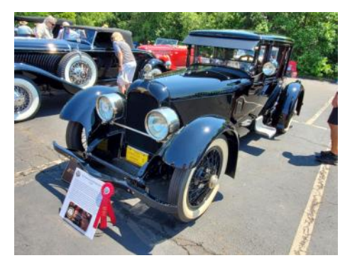
1927 Isotta Fraschini built for Rudolf Valentino