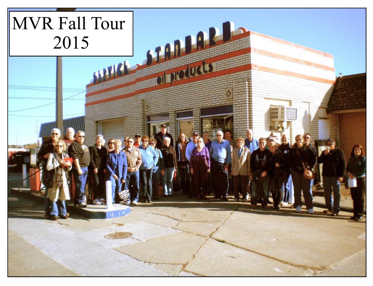
The Fall Tour was a success. There were over 30 participants and approx.. 16 vehicles.

We traveled along Route 6, leaving at 8 a.m. and arriving in West Liberty for a morning break at Jan Brewer's cousins store, Fred's Feed Store which is in a quaint old downtown area of West Liberty. Continued on to Iowa City/Coralville to visit the car museum and have lunch at the Iowa River Room. Continued along to Brooklyn (a small town with a great flag display, a vintage gas station (Group Photo Above) and a historical museum) where we might take a site or two in, another pit stop in between until we hit Grinnell. We arrived in Grinnell approx. 5 pm, checked in to motel and everyone ate at a place of their choice. Sunday morning.....breakfast....short drive around and then off to the Amana's for lunch. After that, we head home. It was a comfortable, scenic drive for cars of all years.... Jan Brewer