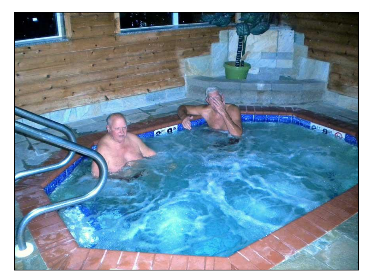
I have no comment about this picture.