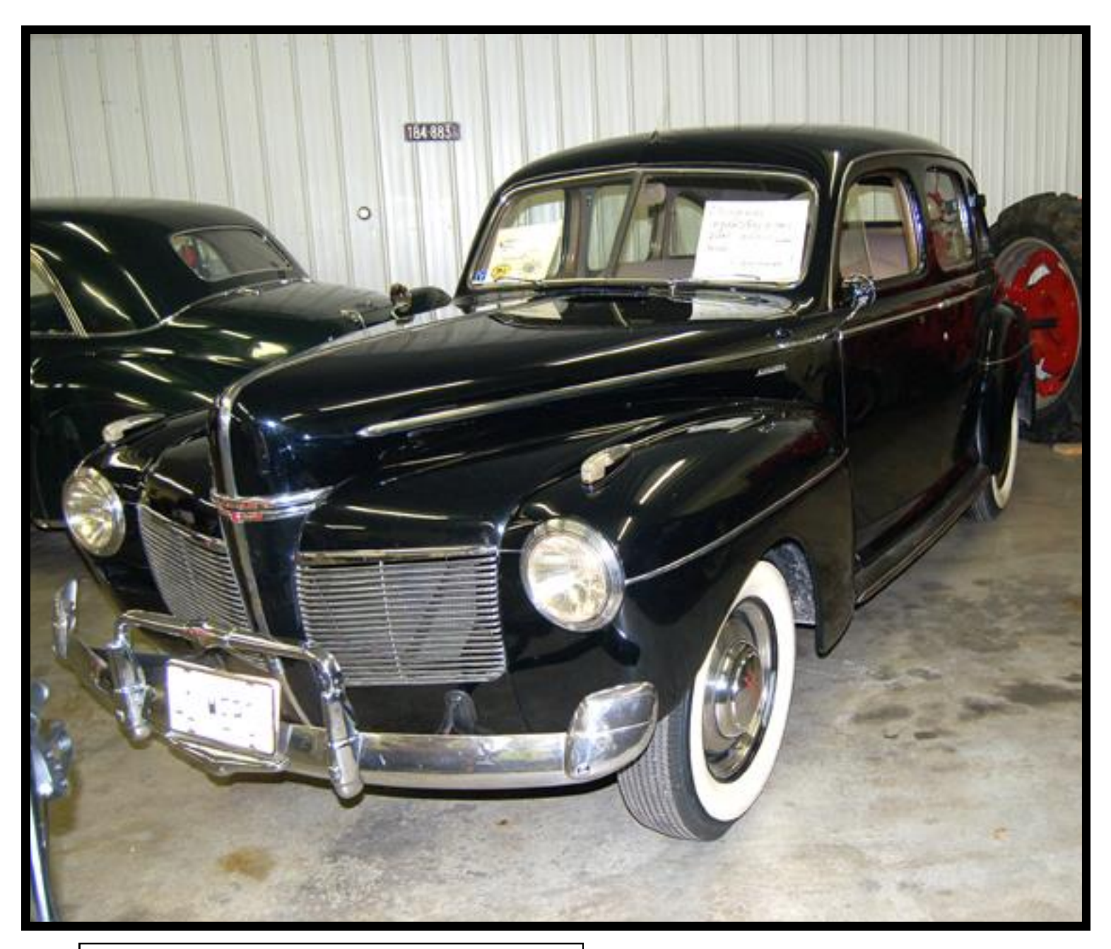
Wayne's 1941 Mercury with 34000 actual miles.