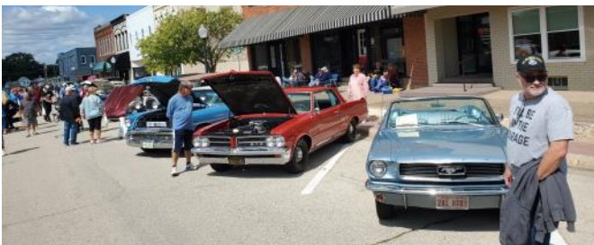
Street and Fly-Over