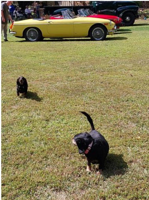
Official Johnson Residence Welcoming Committee