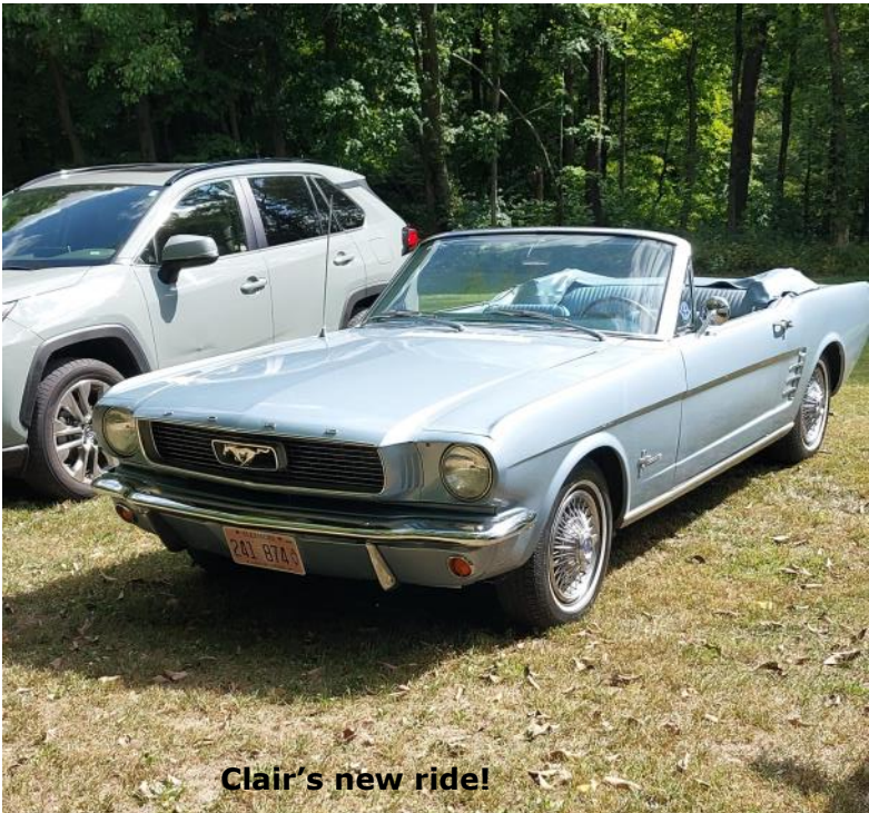
Clair's new ride!