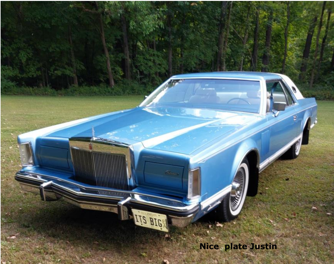
Nice plate Justin