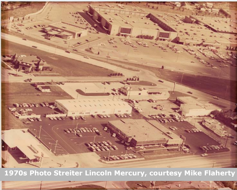
1970s Photo Streiter Lincoln Mercury

Their cars include a 1955 Pontiac Starchief, A 1976 Chevrolet C10 and a 1978 Chevrolet Corvette