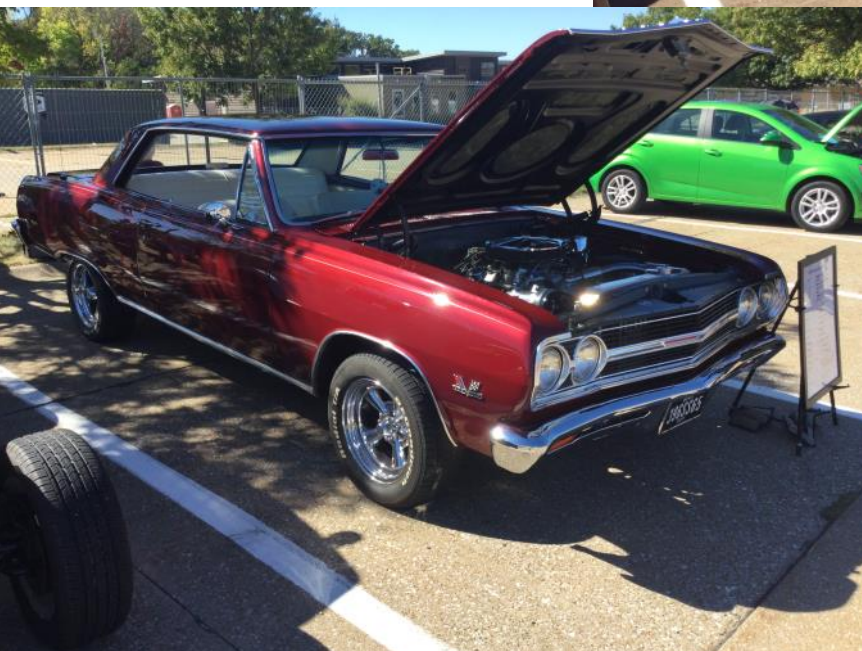
Joe Grant 1965 Chevelle