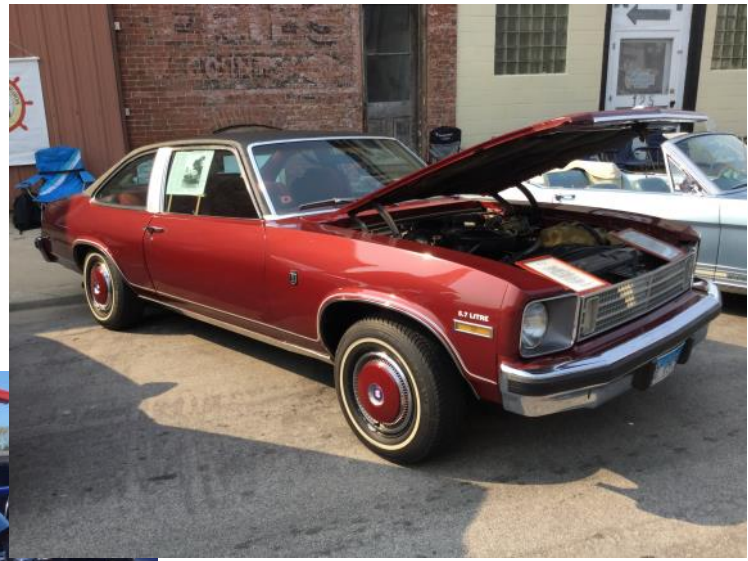
Jim Conrad 1975 Nova

(continued) Blackhawk College Show September 29th.