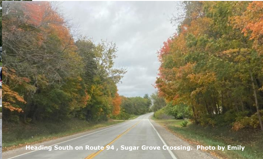
Heading South on Route 94 , Sugar Grove Crossing.