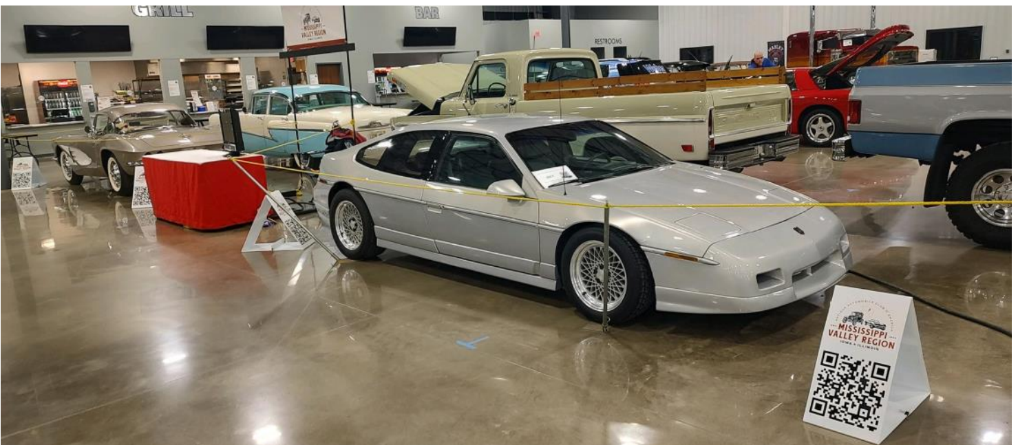
Fred Bartemeyer's 1984 Fiero 2+2 Concept car. One of One produced.