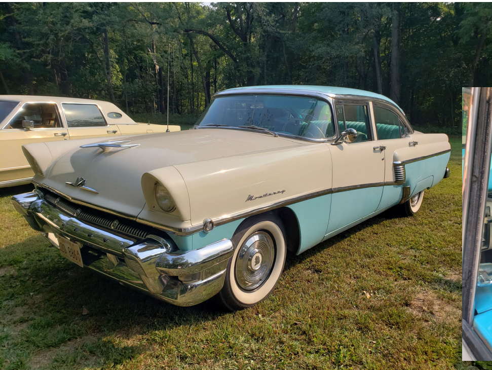
Beautiful Mercury Wayne!