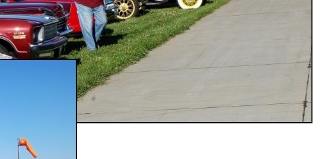
Our first stop was the Davenport Airport for "Donuts & Planes"