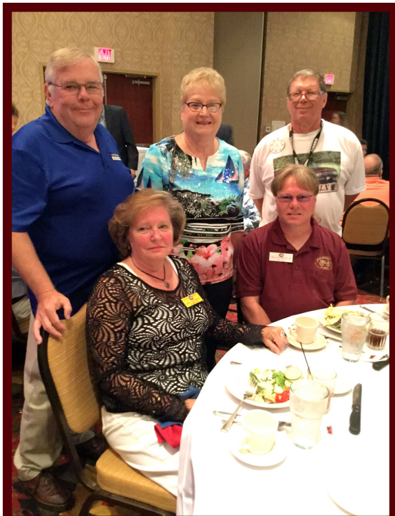
2017 AACA Grand National Independence, Missouri