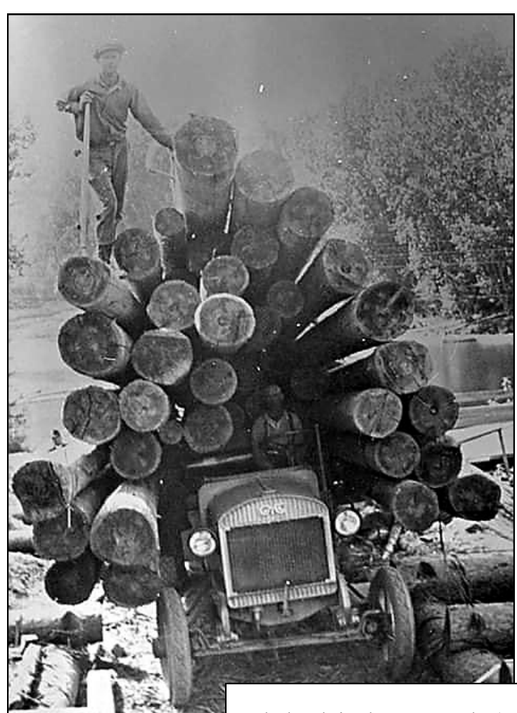
Early hard tired GMC truck (J. Brewer)